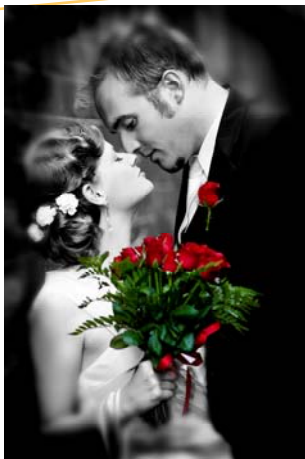
Photographic & Video Services